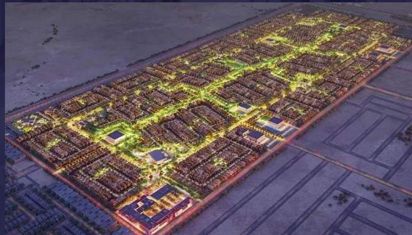
ROSHN & China Harbour Engineering Company Collab, Riyadh, KSA

Consists of administrative, commercial, residential and hotel space.