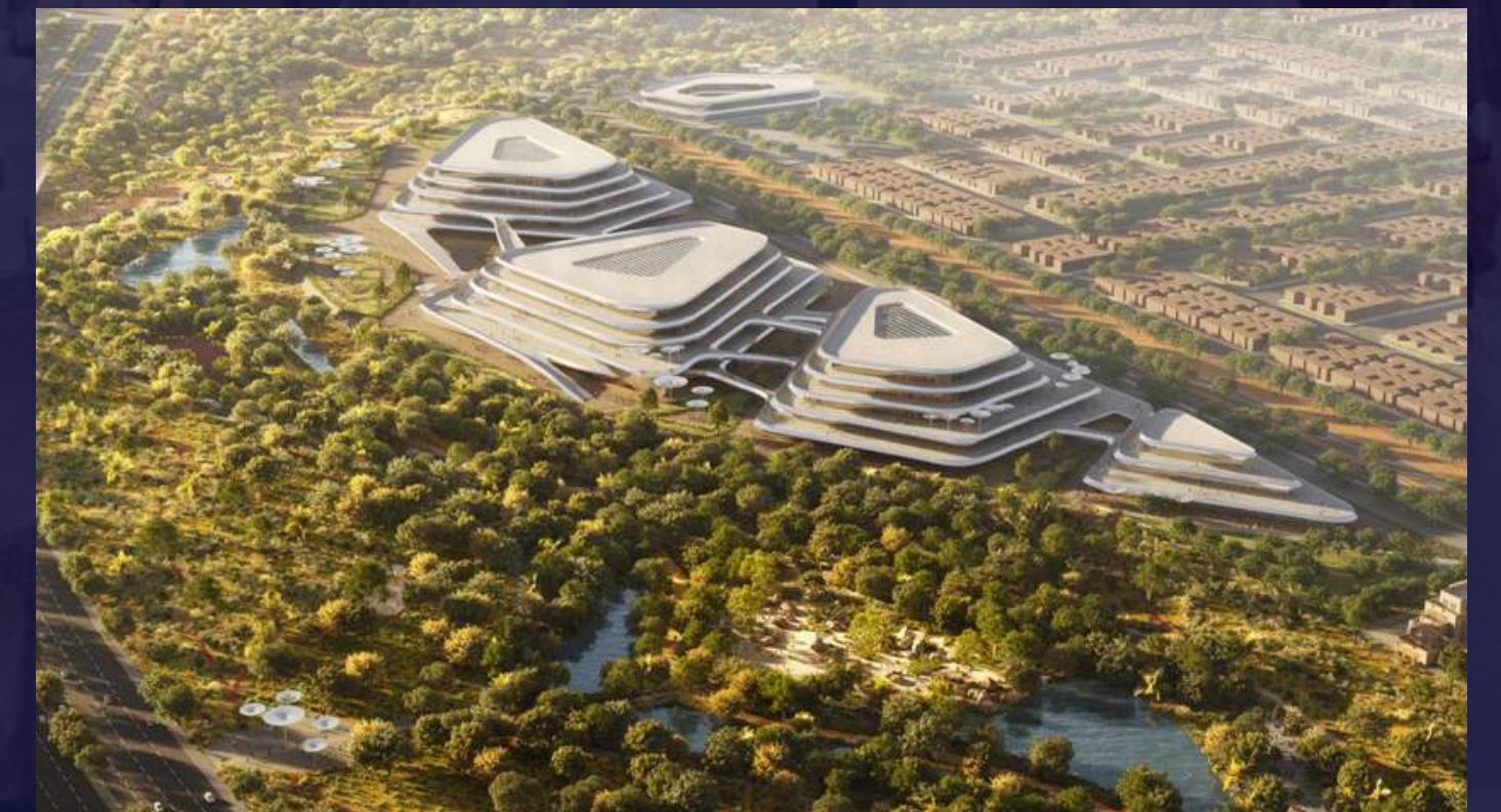
Khuzman Sports City, Riyadh, KSA

Building residential villa units at SEDRA & WAREFA developments.