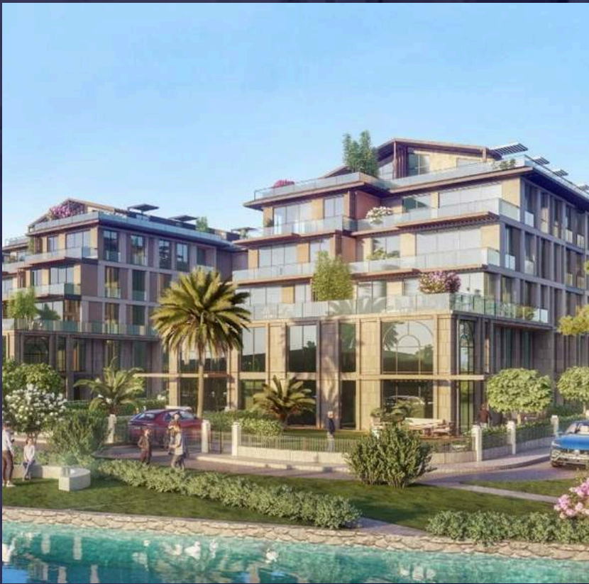
Nafs Koro, Turkey A project on a land area of 26,000 square meters and a total of 9 blocks and 202 residential units and 10 commercial units