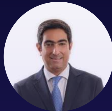
Amr Elhamy CEO The Sovereign Fund of Egypt