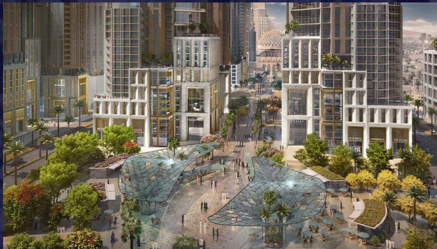
Makkiyoon Urban Developers' Boulevard Makkah Project, Riyadh, KSA

Last year $18.3bn's worth of projects were unveiled.