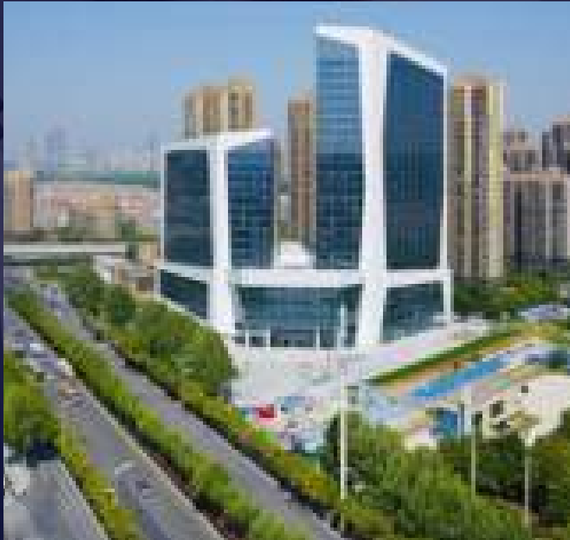
Hefei Minya Centre, China 5-star hotel, plus boutique shops and shopping center