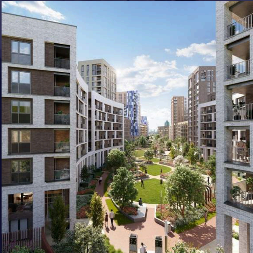
Heathside Apartments, London, UK New studios, 1 and 2 bedroom apartments in a landmark regeneration development